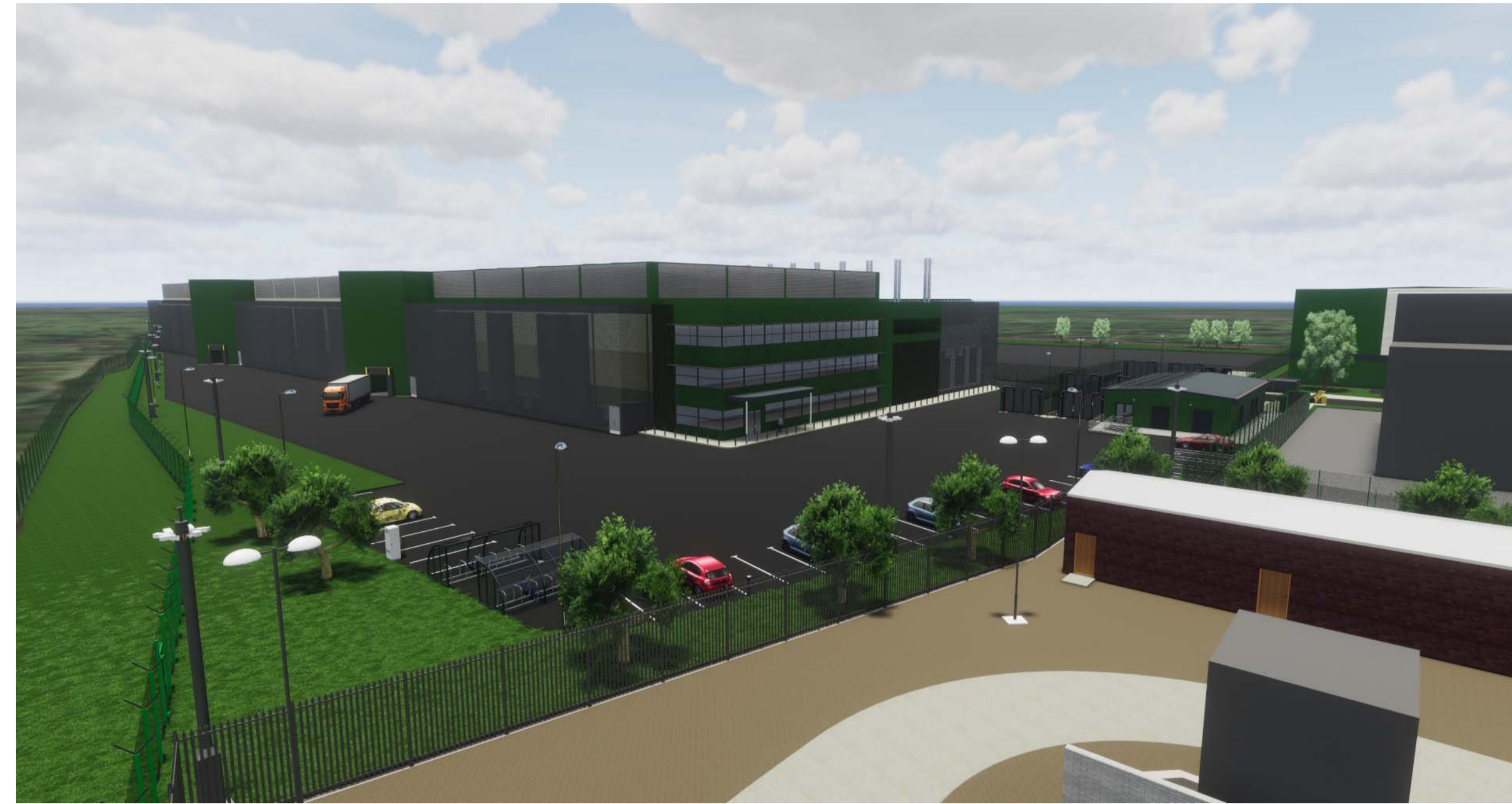
2 Phase 1 - Building Visual 2 1:1