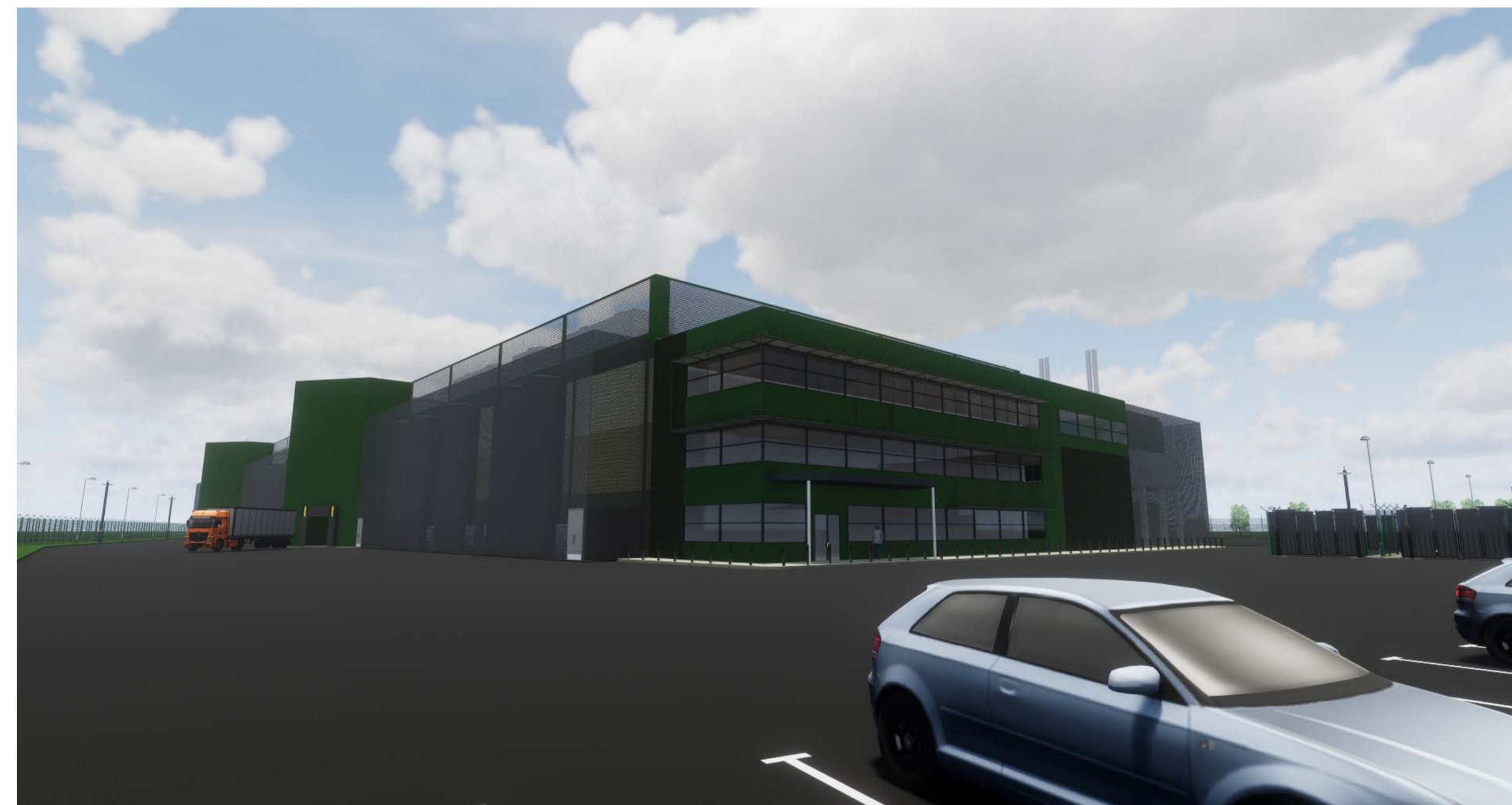
4 Phase 1 - Building Visual 4 1:1