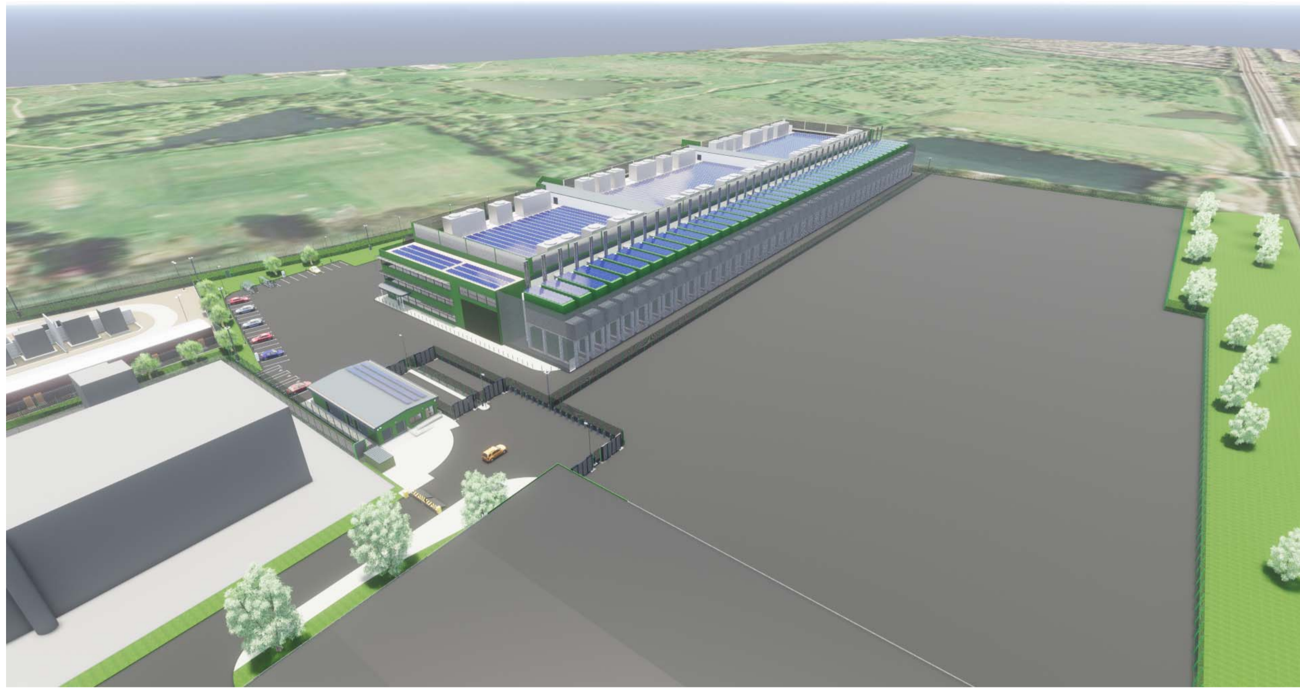
1 Phase 1- Building Visual 1 1:1

NOTES: 1. All rights reserved. All drawings and written material appearing herein constitute original and unpublished works of ARC:MC Limited and may not be duplicated, used or disclosed without written consent. 2. All dimensions shown are in millimetres. 3. This drawing shall be read in conjunction with all Specifications and schedules. 4. All dimensions shall be checked by Contractor prior to any works commencing on site. 5. The contractor shall fully comply with all relevant British standards, regulations, standard codes of practice, methods of working, and good practice. 6. Dimensions shall not be scaled from the drawing and the contractor shall be responsible for obtaining all dimensions and levels on site for the actual setting out of the works.