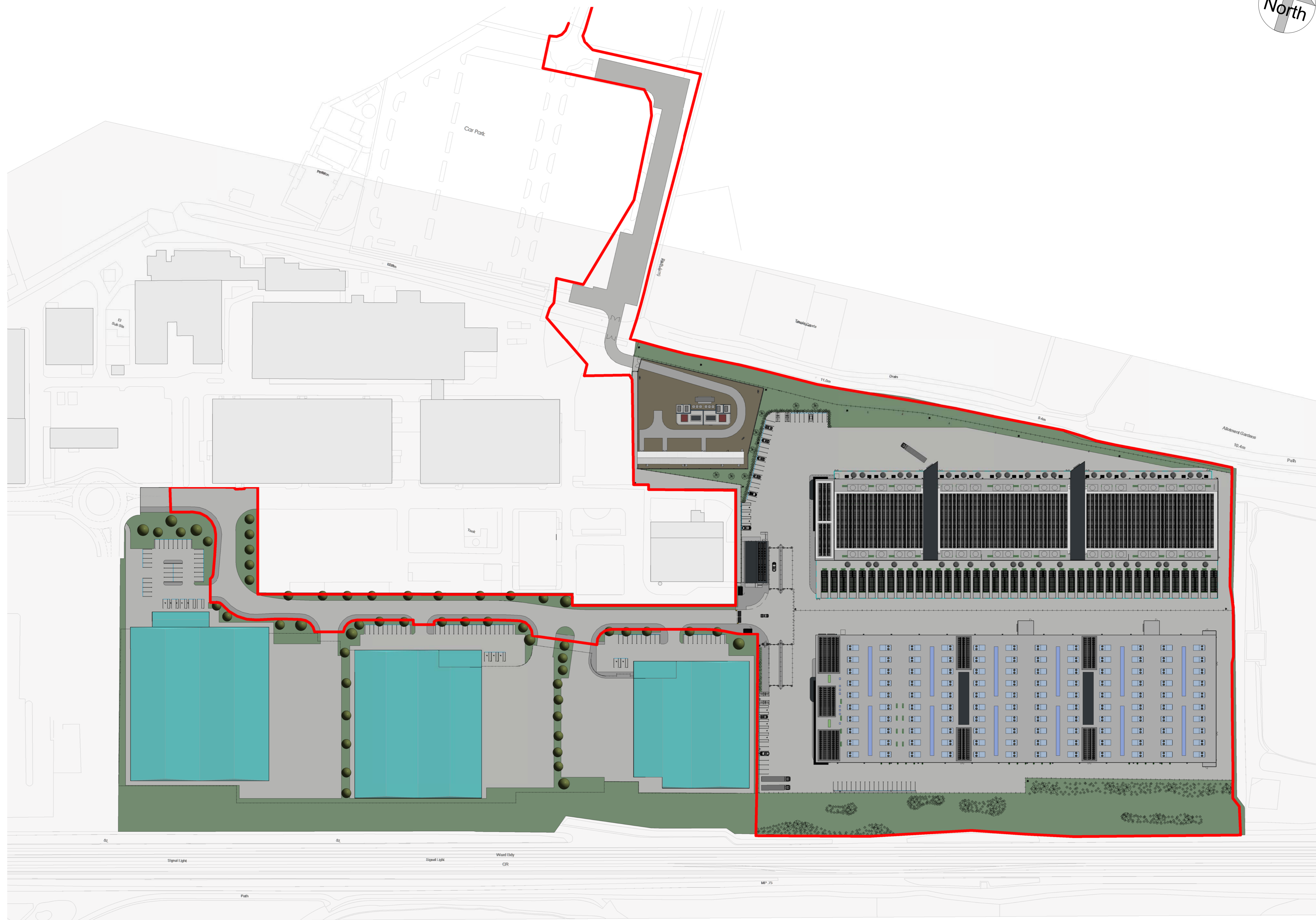
1 Location Plan 1 : 1000