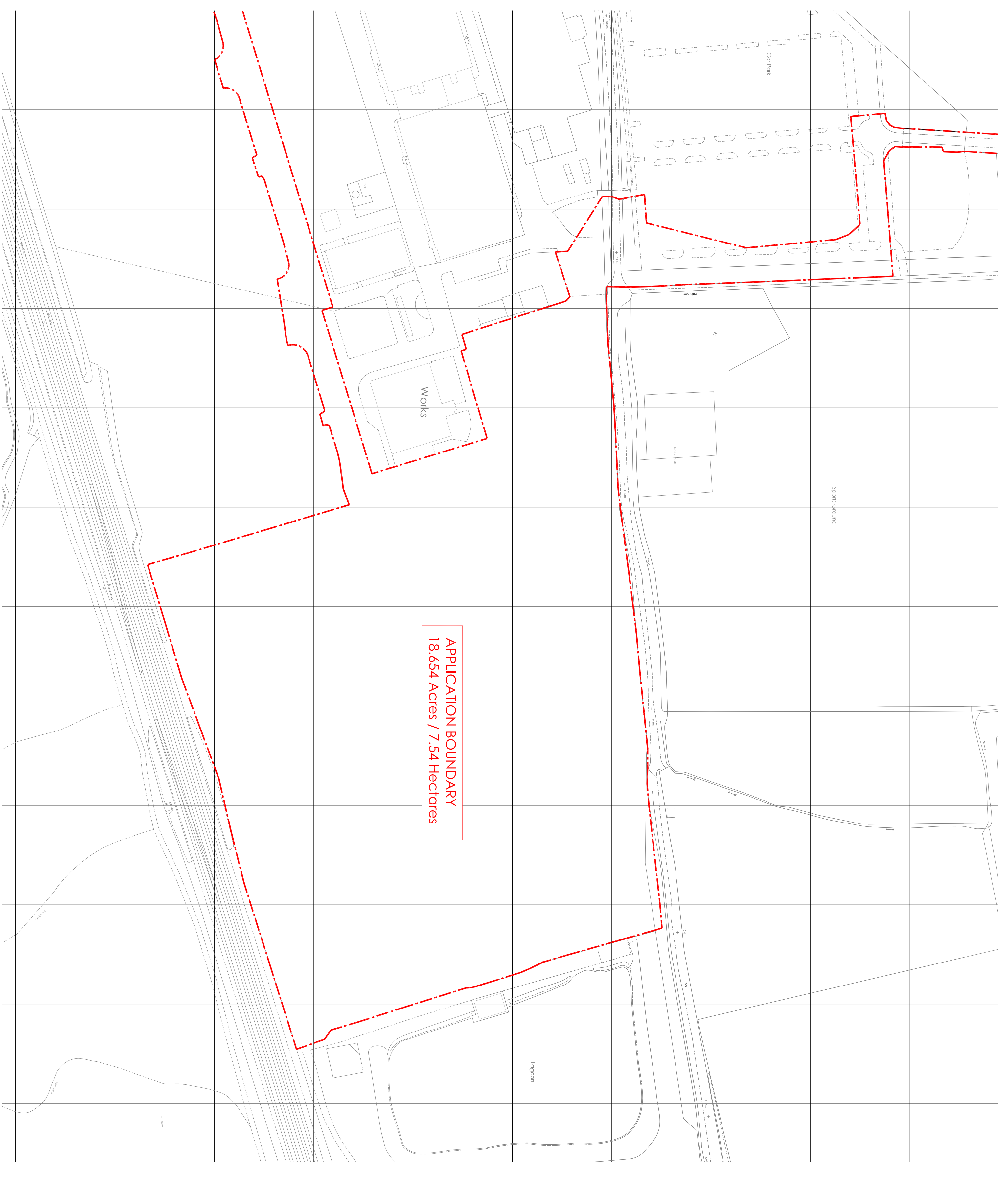
2 ENLARGED APPLICATION BOUNDARY 1 : 1250 @ A1

ALL RIGHTS RESERVED. ALL DRAWINGS AND OTHER MATERIAL ARE THE PROPERTY OF ARC:MC. NO PART OF THIS DOCUMENT IS TO BE REPRODUCED OR TRANSMITTED IN ANY FORM OR BY ANY MEANS, ELECTRONIC OR MECHANICAL, INCLUDING PHOTOCOPYING, RECORDING, OR BY ANY INFORMATION STORAGE AND RETRIEVAL SYSTEM, WITHOUT PERMISSION IN WRITING FROM ARC:MC. THIS DOCUMENT IS THE PROPERTY OF ARC:MC AND IS TO BE KEPT IN CONFIDENTIALITY.