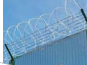
(Illustrative purposes only)